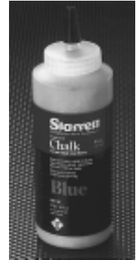
Part No. 63146

Highest quality, specially formulated, powdered chalk colored to mark distinctly. Lays down a hard, clean line that won't blow away. Available in easy-to-use plastic bottles with no-spill cap. For use in all chalk line reels.