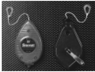
Part No. 63138, 63140

Chalk lines are available in a die-cast reel with a durable enamel finish or molded high-impact ABS black plastic reel. Exclusive slide-action lock and hook ring provide true plumb bob action. Lock releases automatically on rewind. Handle closes flush with the case. Leak resistant tip opens for quick filling with chalk. Supplied without chalk. Top-quality replacement lines on "pop-in" spool. Replacement lines also fit most other chalk reels.