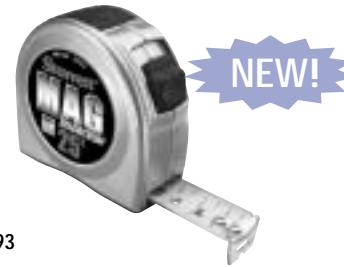
Part No. 66993