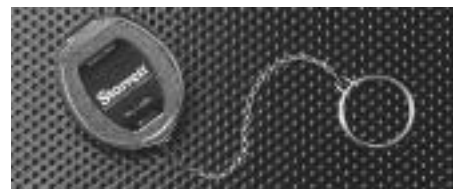
Part No. 63135