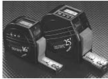
Part No. 64443, 64639