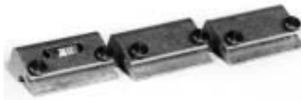
Part No. 3-28

The pocket size, combination degree level makes it easy to establish angles and mark for butt-ins, set tanks, layout keyways and measure decline or slope. This handy pocket level is 2-3/8" long and 1-1/2" wide. This compact tool is permanently marked in 2-1/2 degree increments and numbered every 10°. It has a magnet in the base for easy hands off use and can even hold the end of a tape measure for solo use.