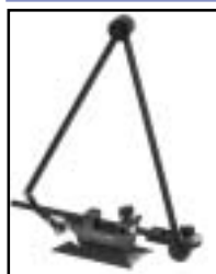
Part No. 052L