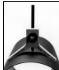
Part No. 53076

As a circle burning guide use this same tool to cut a round plate. Simply place the sharpened pin of the layout tool into your center punch mark and let the magnet slide down to sit firmly on the work surface. The magnet is strong enough to support the weight of your torch, which frees your hands for more cutting control.