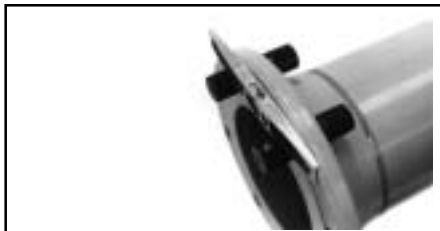
Part No. 42050