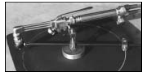
Part No. 28439