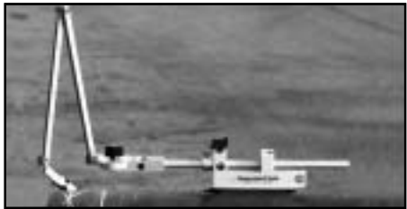
Part No. MM-500