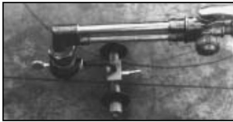
Part No. 24219