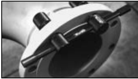
Part No. 38240