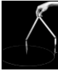
72800 - Small 72810 - X-Large

Important: You must order the delrin bushing that fits your plasma torch when purchasing the "Plasma Wiz."