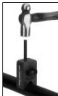
Part No. 53025

These new magnetic support blocks can be attached to any standard square to form your own burning guide. Also use them to hold your square for various jobs. Attach to any straight edge up to 1/8" thick to form your own burning guide.