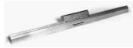
Part No. 12340

Magnetic Base serves as a third hand when cutting large holes. This base comes with a straight pivot pin and suction cups for use on non-ferrous metals. Never use the magnetic base or suction cups when cutting small holes, the heat will damage the magnets or suction cups.