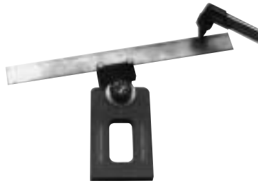
Part No. 70001

NEW Circle Wiz cutting attachment is a must for anyone who cuts small to medium holes in plate or pipe. It is especially handy for cutting out the holes for matching saddle cuts, weldolets and threadolets. Made of solid brass and steel, the Circle Wiz has all the same qualities as other flange wizard tools. The universal brass bushing will adapt to any size or make of cutting torch. The Circle Wiz will cut holes from 5/8" in diameter to 12" in diameter. Simply slide the hardened center pin along the hex arm to attain the proper radius of hole desired. Place the sharpened point in your center mark and you are ready to cut.