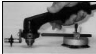
Part No. 77350

Flange Wizard's "New" Plasma Cutting Guide is a handy addition to your plasma cutting machine. Standard model PG-601 will assist you in cutting holes from 5/8" to 36" in diameter. You can use your plasma guide for straight and irregular cuts by using the wheels provided with your cutting guide. You can set up your plasma guide to cut on either the inside or the outside of the wheel. When purchasing your plasma guide, the proper non-conductive bushing to fit your torch, (Part No. 0061), must also be ordered. A magnetic base with a straight pivot pin can be ordered as an accessory item to your plasma guide if desired, (Part No. 77350)