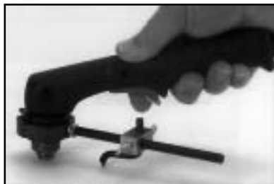
Part No. 30061

The Pipe Flange Aligner saves valuable fit-up time, in most cases it cuts fit-up time in half and eliminates the frustration of balancing a level on the pins.