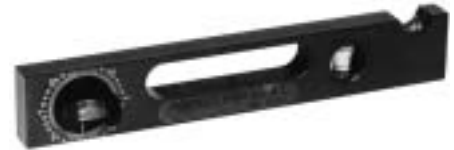
Part No. PP-200