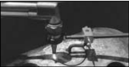
Part No. CW-300

The NEW torch-tip-standoff is a must for anyone who uses a cutting torch and wants to keep their tip at the proper burning height at all times. Not only will this assist you in making more uniform cuts, but will keep your cutting tips from being damaged and always ready for your next burning job. Simply slide the standoff over the cutting tip and against the bottom of the torch nut and tighten the set screw. Now you are ready to adjust the proper height by moving the sliding adjusting rod to a position that will keep the cutting tip at the desired distance from the work and tighten the set screw. You are now ready to burn with confidence.