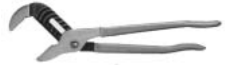
Part No. 0430