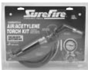
Part No. AA1000