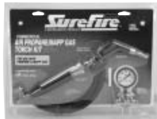
Part No. AP5000