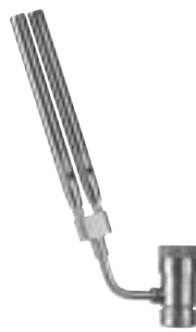
Part No. 0SF9