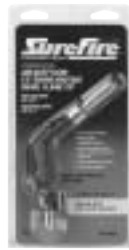
Part No. AA1003S