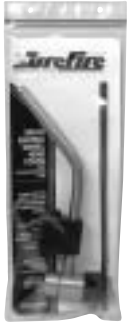
Part No. SF839TS