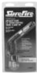
Part No. AA1001S