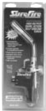
Part No. T655