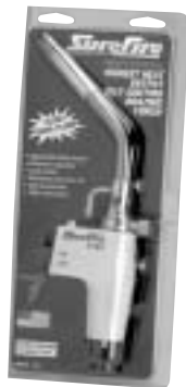
Part No. T757