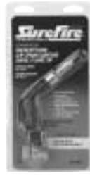
Part No. AA1002S