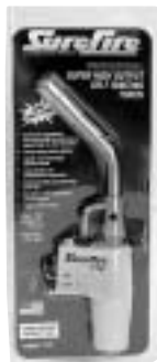
Part No. T747

T111: General Purpose Self Igniting Torch General Purpose Flame to handle a variety of commercial projects.