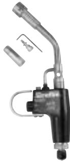
Part No. NG800